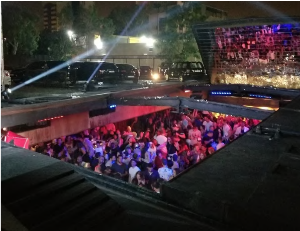
B018 club, Beirut, Lebanon