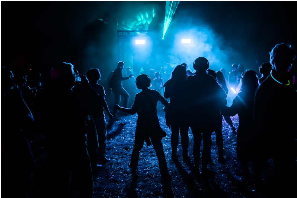
Hospitalfield, Arbroath, Scotland

https://on.soundcloud.com/wQqsFmuNvWHSCxba6